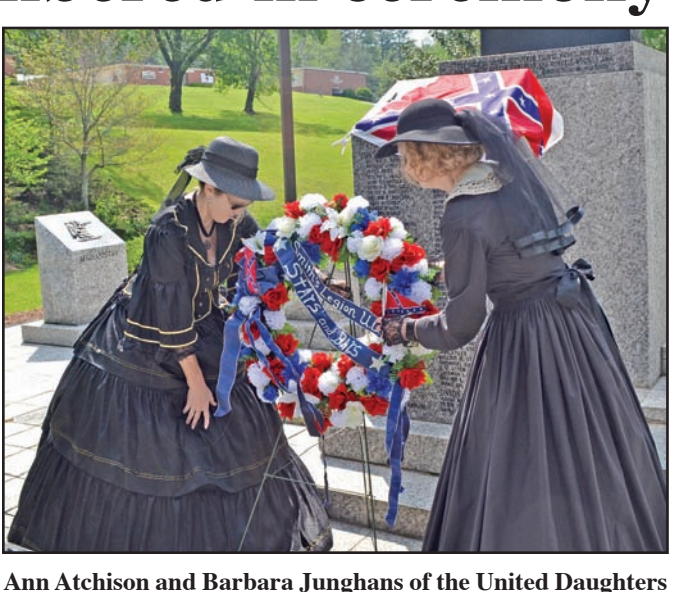
of the Confederacy Smith's Legion Chapter 2699, placing the wreath at the Confederate monument.